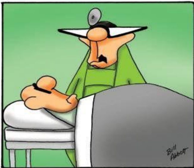
“Your insurance will cover either the vasectomy or the anesthetic. Your call.”