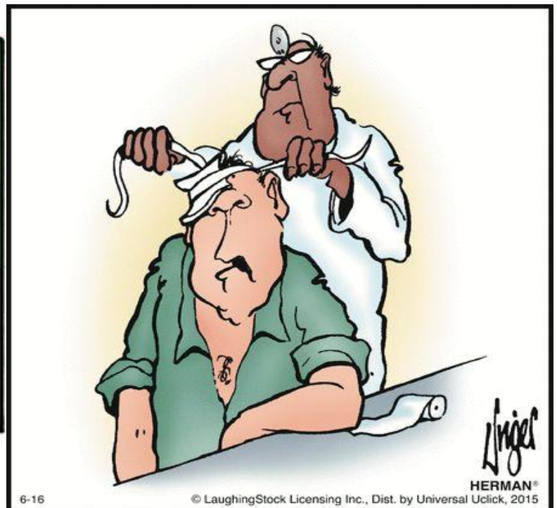
“So I said to her, ‘How about giving me something to remember you by?’”